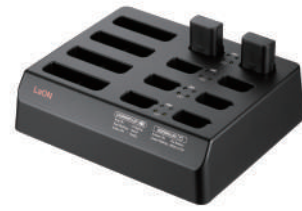
BATCHG225, 8 Port charger