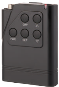
BP850/BP851 Wireless Beltpack