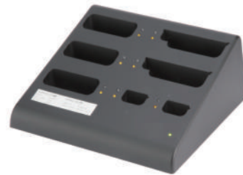
BATCHG125, 7 Port charger

Genie Wireless Beltpacks BP850/BP851 can use five(5) group conference channels to communicate with other devices such as Genie IP Beltpack, Genie Key Panels and external devices, and each Genie group channel can be selected to open the talk/listen path. Up to 128 Wireless Beltpacks can be connected per system of which up to 70 simultaneous talk/listen audio paths are provided with a BS1000 Base Station and 6 Remote Antennas. The 128 Wireless Beltpacks can be connected to any Genie wireless antennas without limitation.