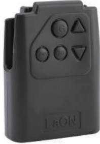
BPPCH100 Beltpack Pouch